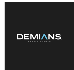
Demians Leasing (02) 9415 0938