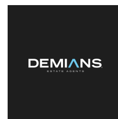
Demians Leasing (02) 9415 0938