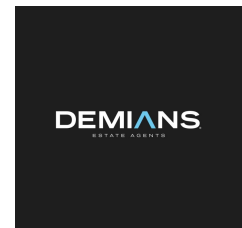
Demians Leasing (02) 9415 0938